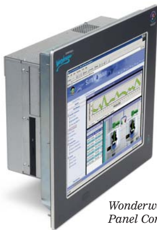
Wonderware Touch Panel Computer