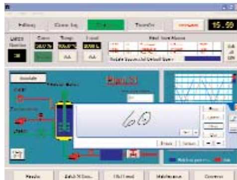
Inking Integrated with InTouch Software

a tremendous amount of time, especially when the Tablet PC is being used as a mobile data collection station.