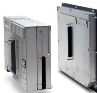
Detachable Display for Easy Replacement

Touch Panel Computers that feature the Microsoft Windows XPe operating system and InTouch software give users the benefit of user-accessible Compact Flash. Customers have relied on Compact Flash to improve the reliability and dependability of their hardware devices because it uses a non-rotating hard disk drive to store operating system and applications information. Wonderware Touch Panel Computers loaded with the Microsoft Windows XPe operating system also help customers save time and money by helping them leverage Compact Flash and the power of InTouch software.