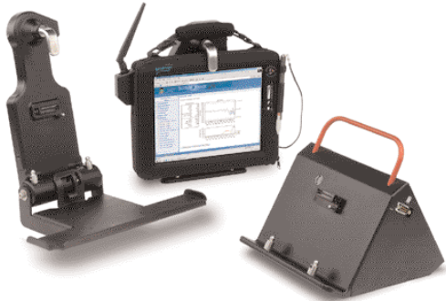
Industrial Tablet with Various Docking Stations

The Wonderware Industrial Tablet is a lightweight, rugged tablet that has been designed and tested to MIL-STD-810F. It is fully sealed, water and dust-proof, and ideal for industrial environments.