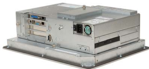
Ports and Drives

The Wonderware Touch Panel Computer has passed a plethora of worldwide certification tests. These computers are designed for harsh industrial environments, yet retain an open, modular structure for flexibility and versatility. Offering two half-size PCI slots and a side-accessible CD-ROM drive, the Wonderware