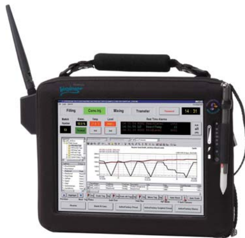
Wonderware Industrial Tablet

desks to perform activities throughout the plant, while maintaining supervisory control of plant processes.