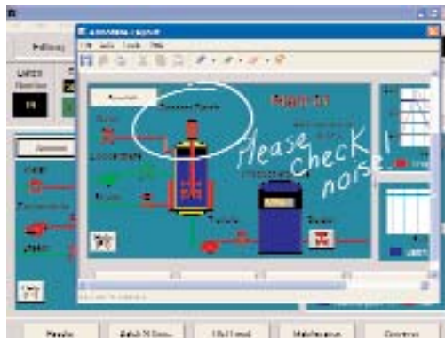
Example: Annotation Feature of Tablet PC

Annotation enables users to mark up a graphical display with pens and highlighters. After capturing and annotating a graphical screen, the user can instantly e-mail, print or save the screen capture to facilitate troubleshooting and explanations of the production process. With this feature, operators and engineers can mark up HMI displays directly, allowing them to quickly and precisely communicate areas of concern or interest and promptly resolve production inefficiencies.